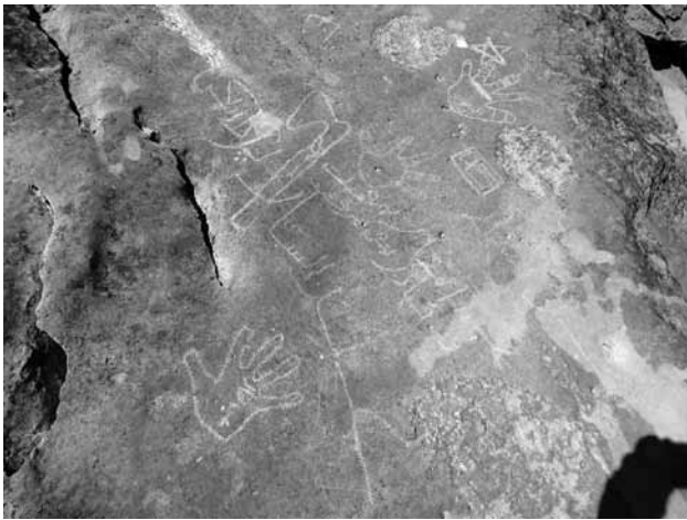
Fig.3 Petroglphs of hand prints and axe at Lahaut rock-art site, Karachi