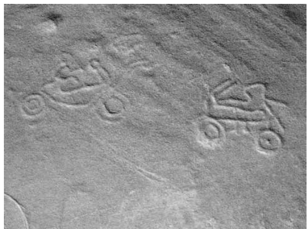
Fig.6 Petroglyphs of motorcycles at Kalri Talhar Rock-art site, Nali Valley