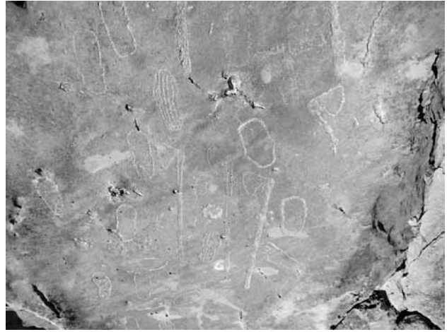
Fig.2 Rock carvings of axes with names of artists and shoeprints at Lahaut rock-art site, Karachi