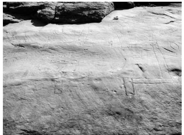
Fig.12 Petroglyph of Mosque at Kalri Talhar rock-art site, Nali Valley