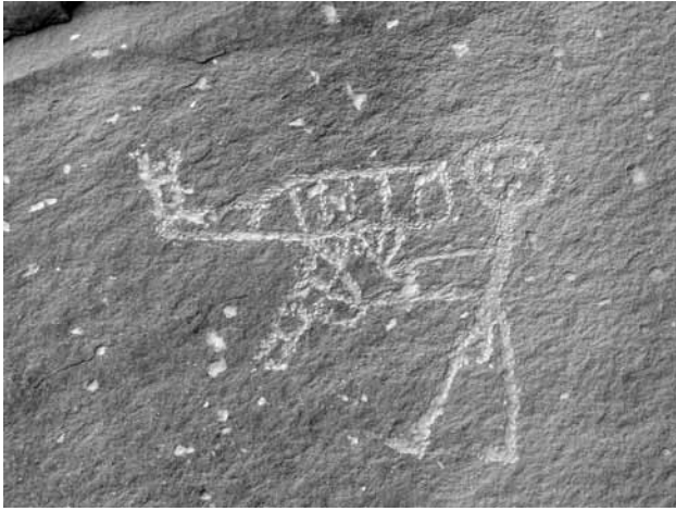
Fig.1 Anthropomorph holding an Ak-47 Kalashnikov at Met dhoro, Gaj Valley