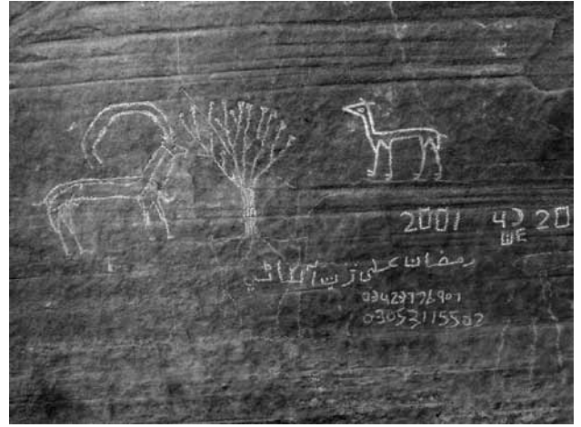
Fig.8 Pictures of plant and ibex with a date and the name of the artist in Sallari Valley