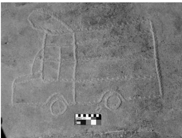
Fig.5 Petroglyph of truck at Pehi kumb, Anagi Valley