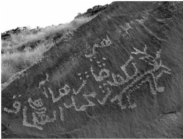
Fig.9 Carving of a stag with inscription in Sindh language