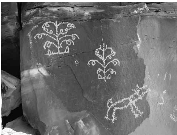
Fig.11 Drawings of plants and animal in Chuchar Valley