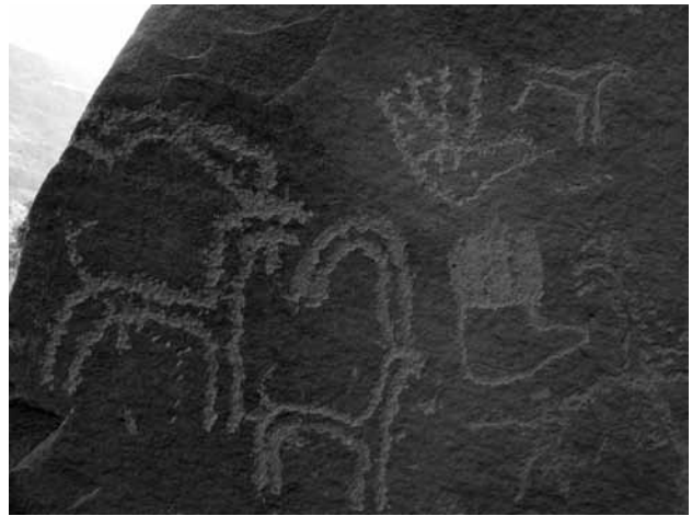
Fig.4 Pictures of hand prints and ibex in Makhi Valley